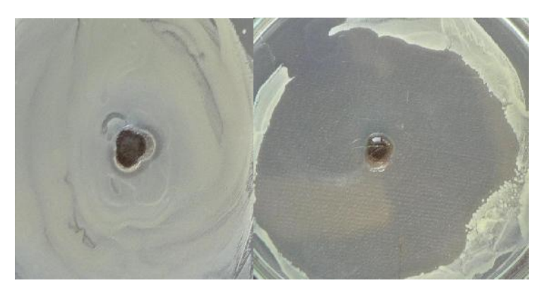
Fig. 3. Zone of inhibiton of L. innocua growth by agar well diffusion assay in PCA; A. cell free Supernatant treated with trypsin 500 IU ml<sup>-1</sup>; B. cell free supernatant of L. lactis

<sup>a</sup>Adjusted to pH 6.5. <sup>b</sup>500 IU ml<sup>-1</sup> <sup>c</sup>0.1 mg ml<sup>-1</sup>; + inhibition zone; – no inhibition zone